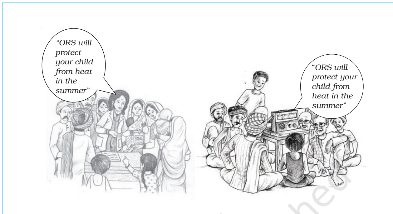
Fig.6.3 : Face-to-face Interaction versus Media Transmission. Which one works better? Why?

Finally, the mode of spreading the message plays a significant role. Face-to-face transmission of the message is usually more effective than indirect transmission, as for instance, through letters and pamphlets, or even through mass media. For example, a positive attitude towards Oral Rehydration Salts (ORS) for young children is more effectively created if community social workers and doctors spread the message by talking to people directly, than by only describing the benefits of ORS on the radio (see Figure 6.3). These days transmission through visual media such as television and the Internet are similar to face-to-face interaction, but not a substitute for the latter.